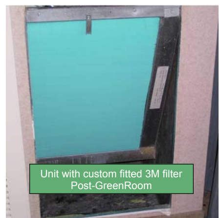
Unit with custom fitted 3M filter Post-GreenRoom

Upon completion, \Delta T , airflow data and particle counts were recorded without the filter in the units. A custom fit, antimicrobial 3M filter was installed and the data collection was repeated.