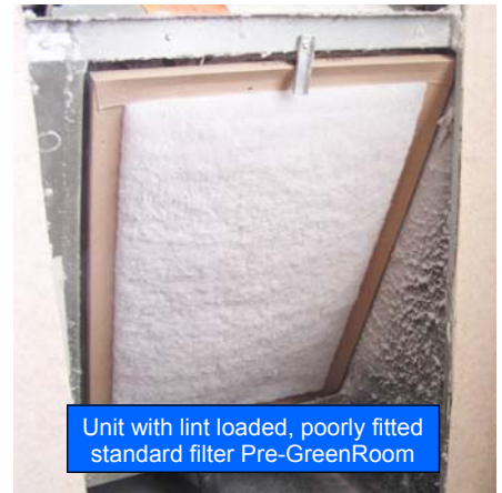
Unit with lint loaded, poorly fitted standard filter Pre-GreenRoom

The units were restored using the AERIS Atlantic GreenRoom Program utilizing the patented AERISGuard multi-enzyme technology which is ph neutral and environmentally friendly.